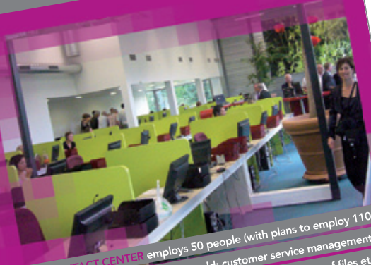
EOS CONTACT CENTER employs 50 people (with plans to employ 110 in 2 years' time) in Saint-Avold: customer service management, telemarketing, telesales, crisis cell, appointments, qualification of files etc.