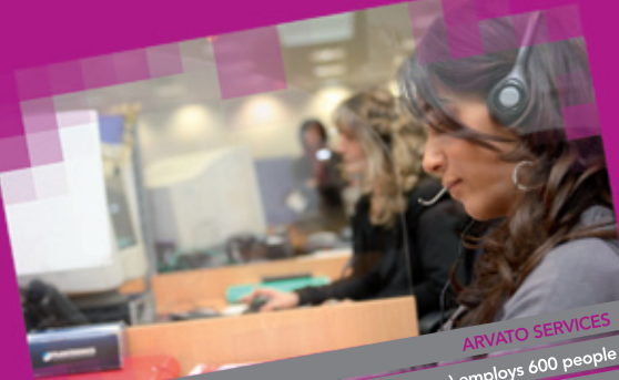
ARVATO SERVICES (Bertelsmann Media Worldwide Group) employs 600 people in customer service, its sorting centre and printing.